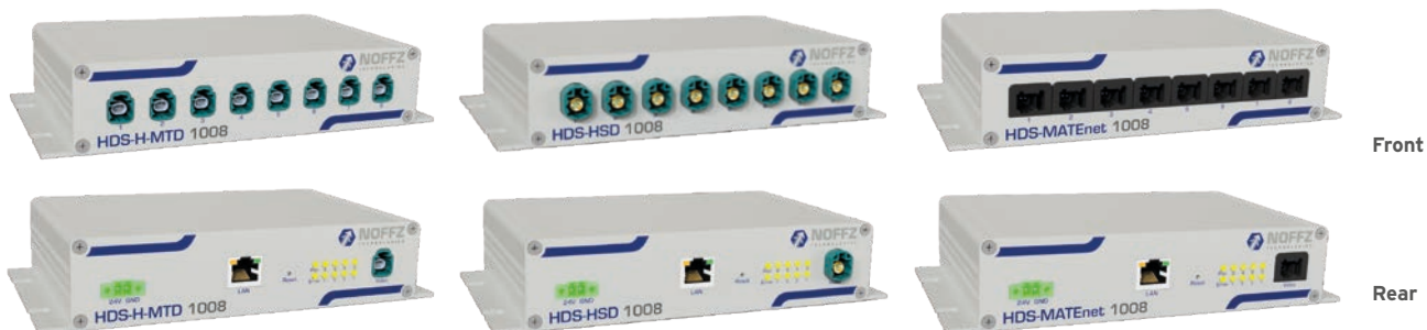
NOFFZ HDS with different automotive connectors like HSD, MATeNet & H-MTD