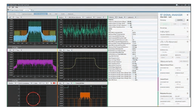
NI RFmx Soft Front Panel for real-time interactive measurements

Are you ready to measure new technologies by selecting transceivers that support 6 GHz WiFi channels, 10 GHz UWB or 5G NR in the mmWave range?