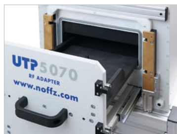
UTP 5070 RF Adapter